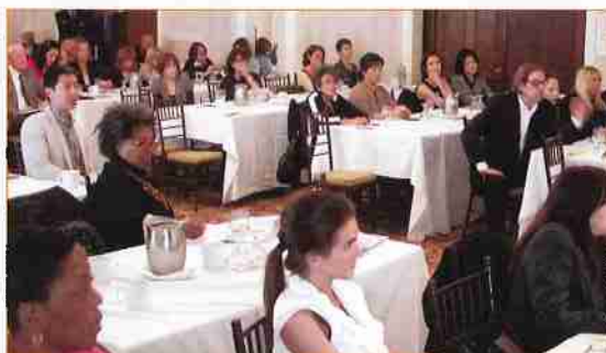
Attentive students fill the room at the ACE 3-day conference