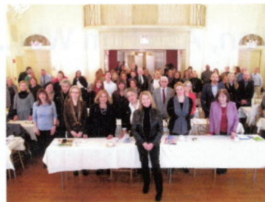
Over 120 agents attended the ACE Winter Symposium 2015